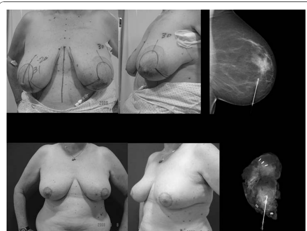
Figure 3 Oncoplastic breast conserving surgery. Breast cancer and macromastia treated using a mammoplasty technique. A 58-year-old woman with large breasts who presented with an invasive small ductal carcinoma of 7 mm. in the inferior retroareolar area of the left breast diagnosed by screening programme. She was treated using an onco-therapeutic mammoplasty with a T-inverted pattern incision and a superomedial pedicle to transpose the NAC to 6 cm up and the inferior one to increase the inferior pole breast projection. Above. Preoperative view. We used a wire for tumor location. Sentinel lymph node biopsy was carried out resulting negative. On the left side, above, mammogram with a wire inserted in the tumor. On the left side, below, the x-ray test of the surgical specimen of a really wide resection weighing 175 g. can be seen. Below. Appearance at five weeks postoperatively with a good cosmetic outcome before adjuvant radiotherapy. It can be seen that there are shoulder bra strap groovings and that the left breast is intentionally slightly bigger than the right one because the effect of radiotherapy would equalize them.

Nevertheless, the possible disadvantages that this management policy could bring to the BCU should also be discussed. The main one it is that RM is a time-consuming procedure. In this series of patients the average operating time was 200 minutes but what should be taken in account is that, to begin with, it takes longer and the operating time varies much more because it all depends on surgical skill level [18], so the majority of cases are performed as an isolated procedure; for that reason our offer is limited to about 20 patients per year. This number might be enough to improve oncoplastic training but it is clearly insufficient for the demand from large-breasted patients.