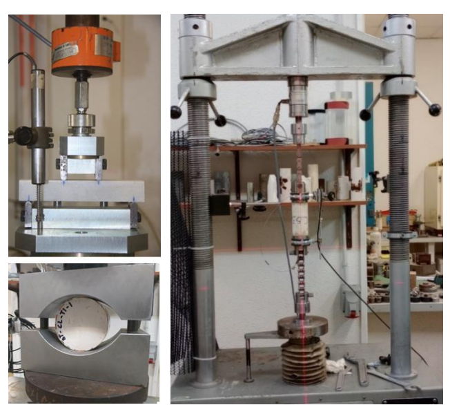
Figure 2. Test set-up of the different tests.