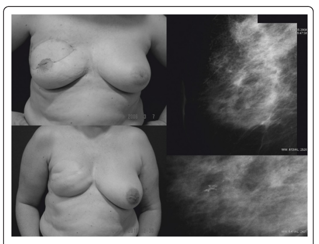
Figure 1 Appearance of the patient who suffered from an ipsilateral breast cancer recurrence, she underwent a skinsparing mastectomy and immediate breast reconstruction with an adjustable breast implant. She did not want undergo a reduction mammaplasty for simmetrization. Mammography showed a small group of microcalcifications; the core biopsy confirmed an in situ ductal carcinoma.

We were able to interview and evaluate 23 patients cosmetically, the reasons for this being: three patients died, one had an ipsilateral recurrence and was mastectomized, three had a distant recurrence and were in a bad state, one was diagnosed and treated for contralateral breast cancer and one had a surgical procedure on the affected breast, while the rest refused to participate