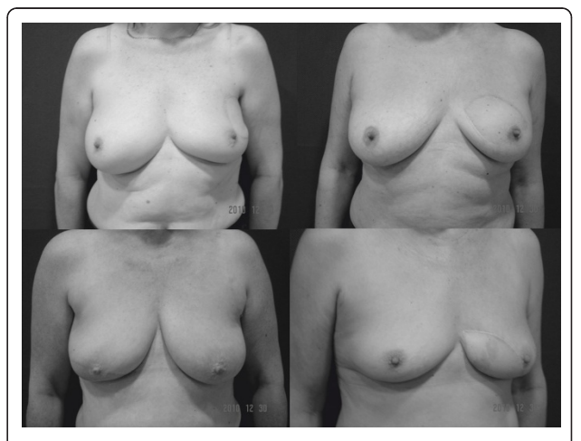
Figure 2 Long-term aesthetic results of OVR used in the four quadrants of the breast.

Our series can be characterized with some data: patients below the average age of breast cancer (44 years) with medium size breasts (705 cc average of total breast volume) suffered from tumors with 22 mm of average size (22 after neoadjuvant chemotherapy) located in all quadrants of the breast, multifocal in 20% cases, with high rate of axillary lymph node affectation (46.3%) and triple-negative receptors (31.7%). The OVR