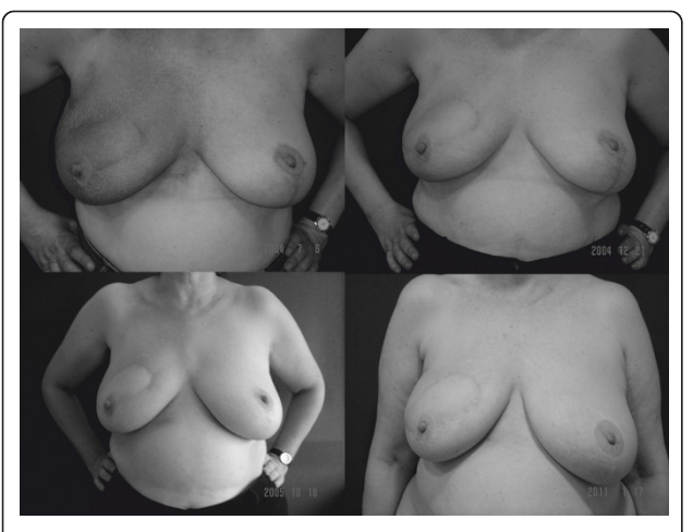
Figure 3 Appearance of the patient at different times, while the radiotherapy was delivered and, three months, two years and five years after the end of radiotherapy.

In 19 patients we observed the evolution of the cosmetic outcomes because they were assessed subjectively by a mixed panel in 2005 or 2007. Only four patients have changed their assessment with deterioration from good to fair (Figure 3). The main reason that could