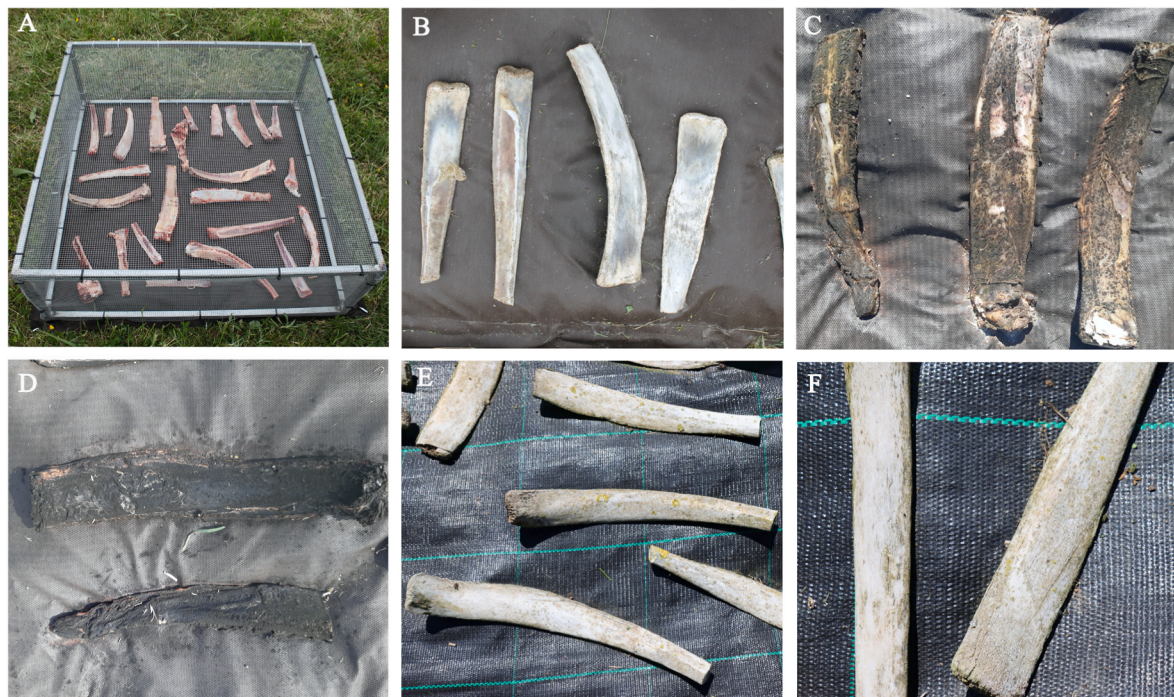
Fig. 3. Different stages of the decomposition process in the cow ribs used for this study. A) Fresh; B) Bloat; C) Active decay; D) Advanced decay; E) Skeletonization; F) Fine cracking marks on the bone surface.

different tasks periodically conducted. Firstly, three ribs are monitored as specimen controls to register all the macroscopic traits during the whole experiment. Regular inspections are conducted monthly, photographing the ribs, recording the macroscopic changes suffered in their bone surfaces and comparing them with the meteorological data. Secondly, ribs extraction being carried out to remove, store and register the accurate changes seen at each monitoring stage. Thus, a rib was removed every four months during the first year of experimentation and subsequently, a rib has been extracted annually during the initial four years. Consequently, the investigation may last up to 18 years.