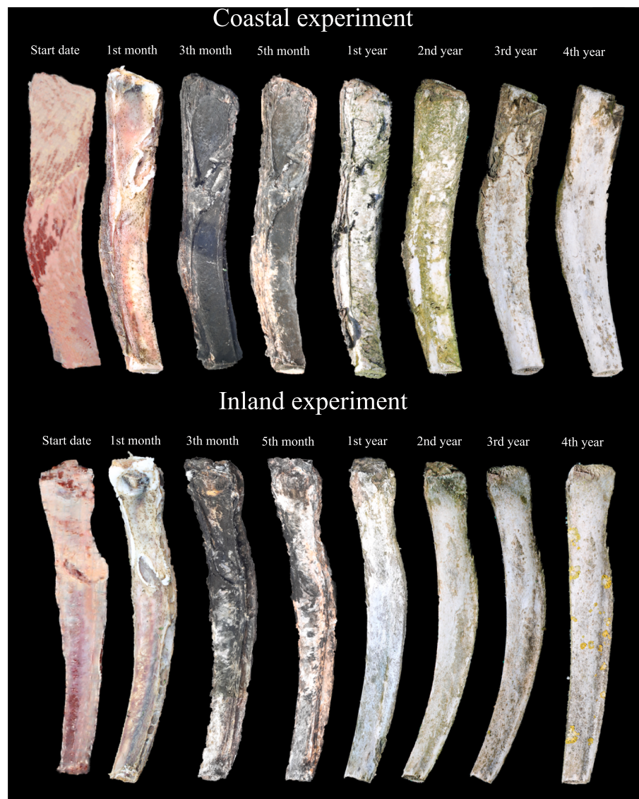
Fig. 4. Monitoring of a specimen control from the coastal and inland experiments during the first four years of the experimentation.

them before they were affected by any weathering stage (Andrews and Armour-Chelu, 1998). Similarly, in the Draycott experiment, no evidence of weathering after eight years of monitoring was observed in the bones due in part to the nature of the site, a rockshelter surrounded by vegetation with low sun exposure. This case could be used for comparisons with karstic environments, where the weathering modifications are similar (Andrews and Cook, 1985). The study of Riofrío (Segovia, Spain), in a temperate mountain environment, is similar to the British experiments, but some bones reached the weathering stage 3 after 16 years of experiment, although most presented low weathering stages (Cáceres et al., 2009).