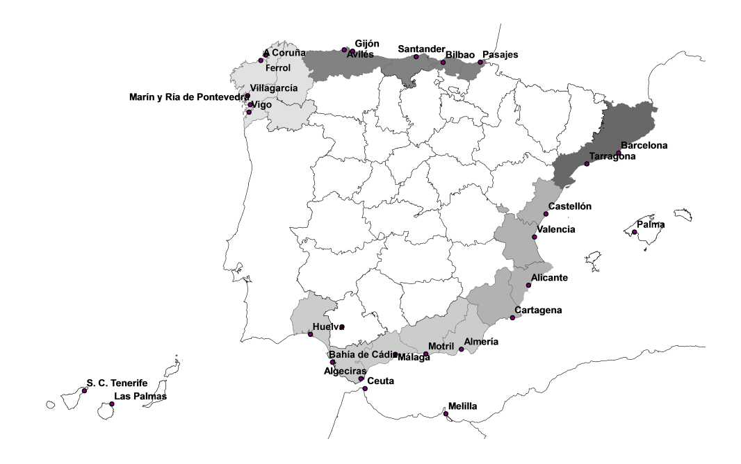
Fig. 3: Seafronts at the Spanish port industry.

capacities, we replace them by their means<sup>3</sup>.