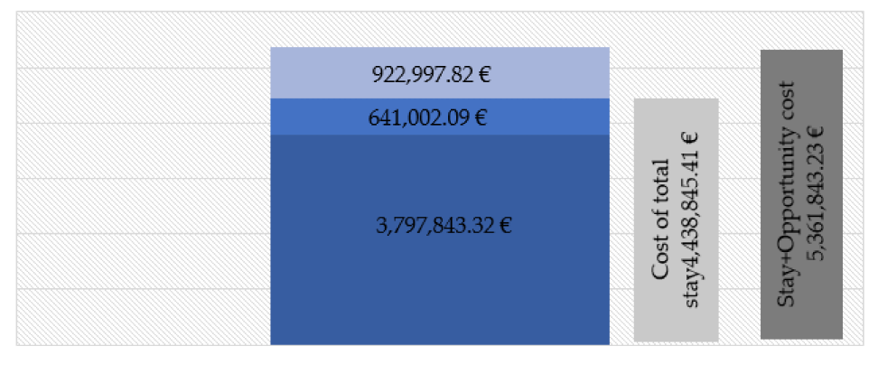
■ Cost of appropriate stay ■ Cost of prolonged stay ■ Opportunity cost

of €3,797,843.32 according to the DRG process. The cost of prolonged stay amounted to 641,002.09 (14.44% of the total); however, considering the prolonged stay that would have corresponded to the same DRG and year of discharge, it amounted to 851,447.29 (21.17% of the total). The total cost resulting from the sum of both periods is 9.41% higher if the actual hospital stay is considered. The estimated opportunity cost according to the value of the UCH of the prolonged stay period was €922,997.82, although, once again, considering the prolonged stay that would have corresponded for the same DRG and year of discharge, it amounted to €1,170,102.31. Finally, the total cost was 3.18% higher, considering actual hospital stay.