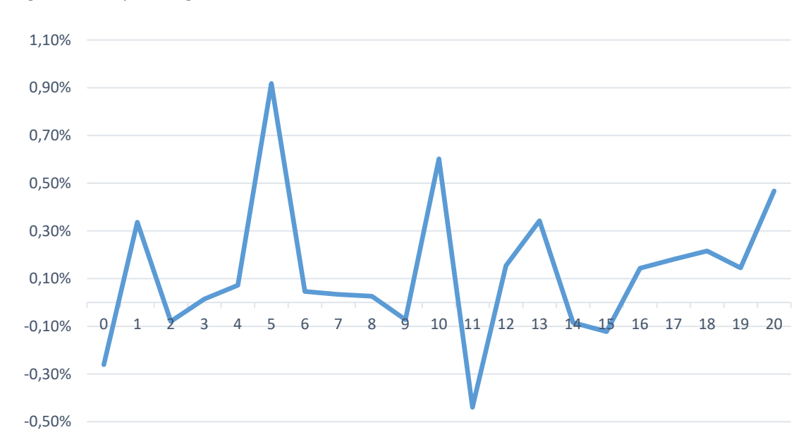
Figure 2. Daily Average Abnormal Returns from the certification date