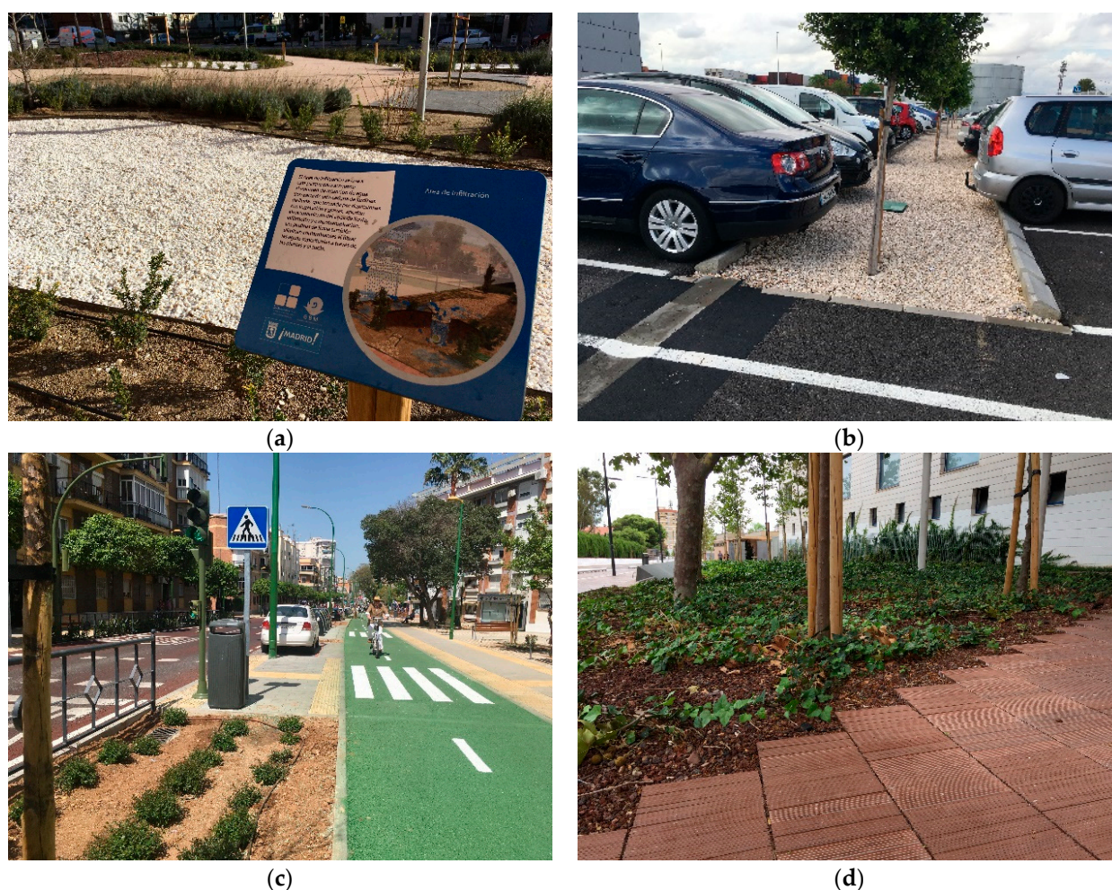
Figure 2. (a) Infiltration–detention basin in Alfonso XIII park (Madrid); (b) infiltration trench in Ribarroja; (c) bioretention systems and permeable pavement in Sevilla; (d) ceramic permeable pavement in Benicàssim.

After two decades of SUDS implementation in Spain, sustainable drainage solutions are becoming more familiar to municipal practitioners and politicians. To achieve this take-off, research on SUDS is of paramount importance; demonstrations of good performances from the quantity and quality perspectives are crucial to promote this change with solid steps.