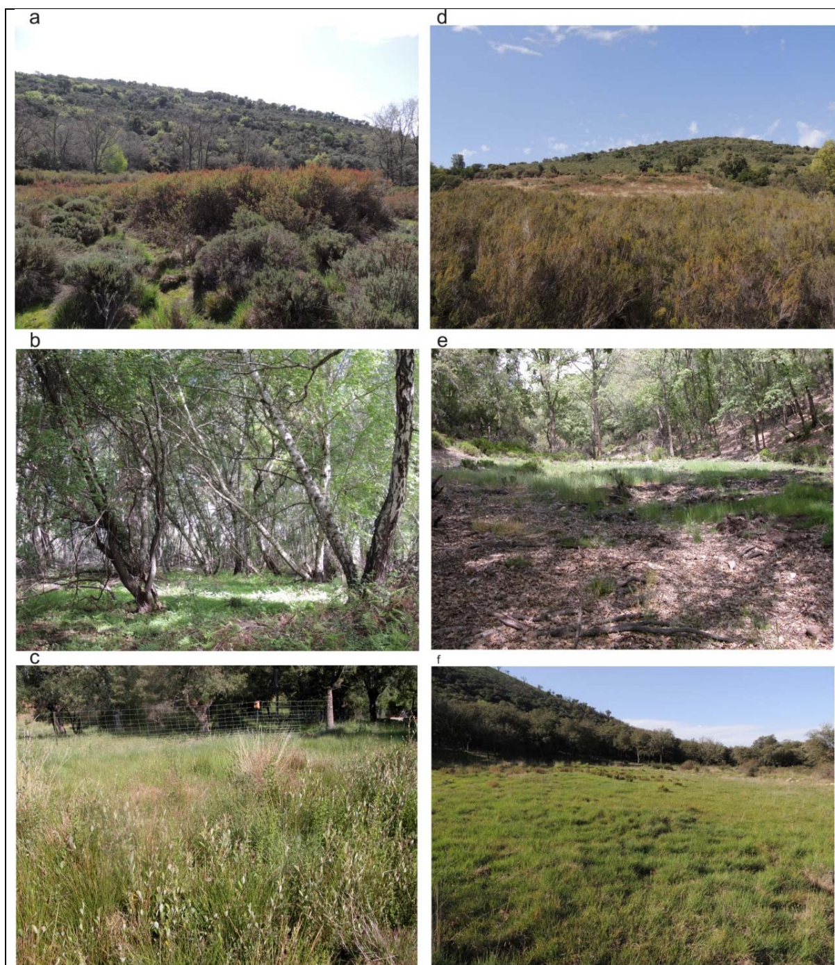
Figure 2. Peatlands in the Toledo Mountains: (a) the ombrogenous site of Brezoso; (b) birch forest on La Ventilla peatland; (c) perimeter fence of the Bermú site; (d) Canalejas peatland; (e) Valdeyernos peatland; (f) open habitat on Fuente de la China peatland, which is influenced by periodic disturbance and hosts a large population of Rhynchospora alba .