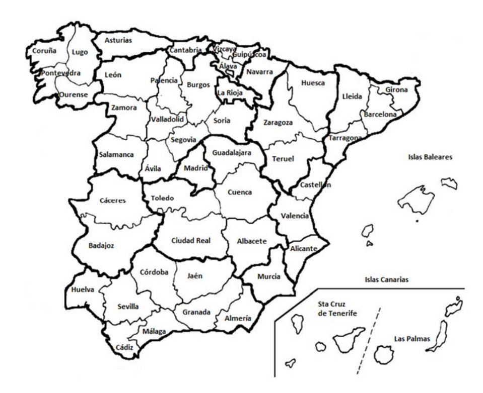
Note: Regions are represented by bold lines.