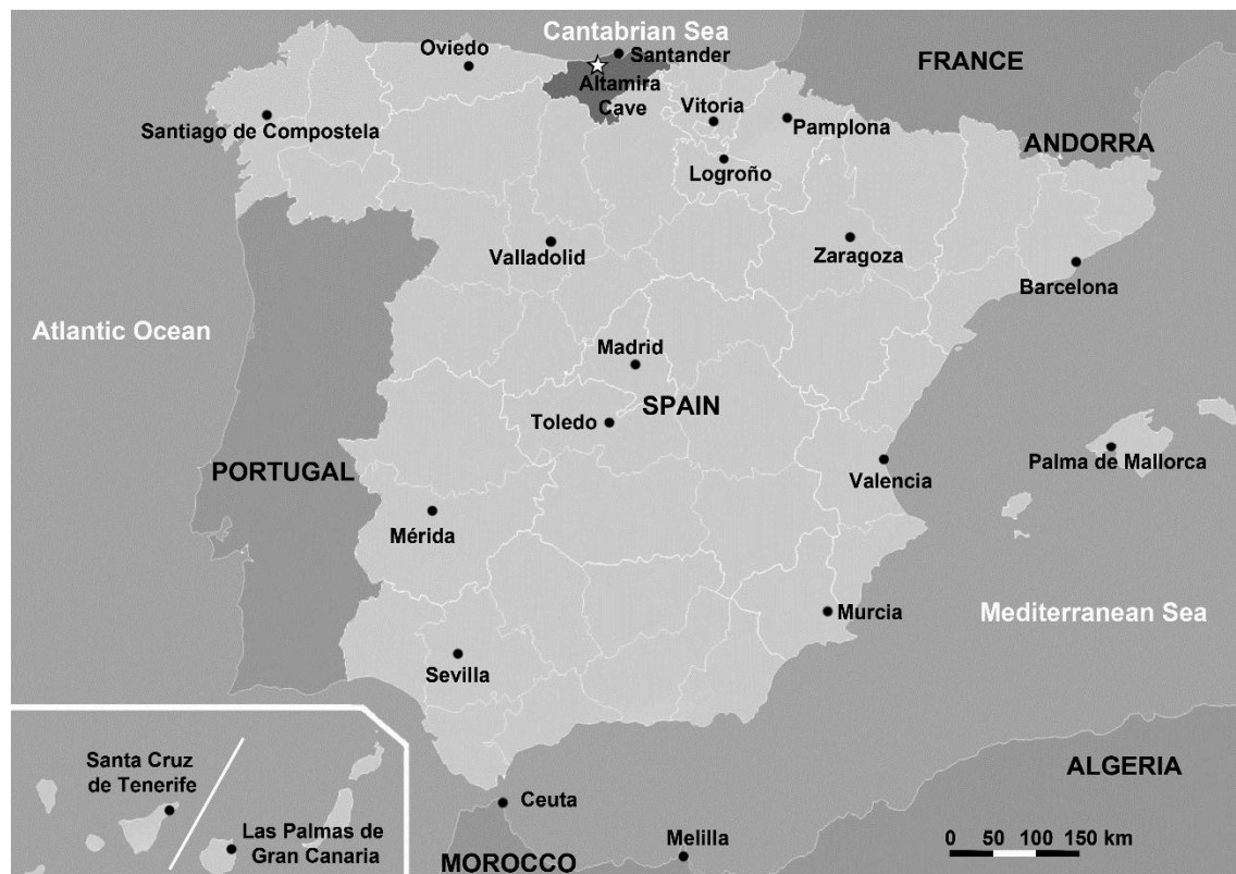
Figure 1. Location of the Cave of Altamira.

The Polychromes Chamber is 60 m away from the entrance, at a lower level. The cave was generated by rock falls and gravitational collapses [7].