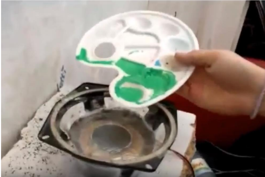
Figure 3. Soundwave Painting project by Hungarian students

In their SOUND WAVE project, the team of Szilágyi Erzsébet High School from Hungary have merged physics and art – they experimented with sound waves and how to paint with them, see Figure. 3. Similarly, this was subsequently featured in a CHAIN REACTION project, which can be seen at: https://kiks-microbit.wikispaces.com/Chain+Reaction