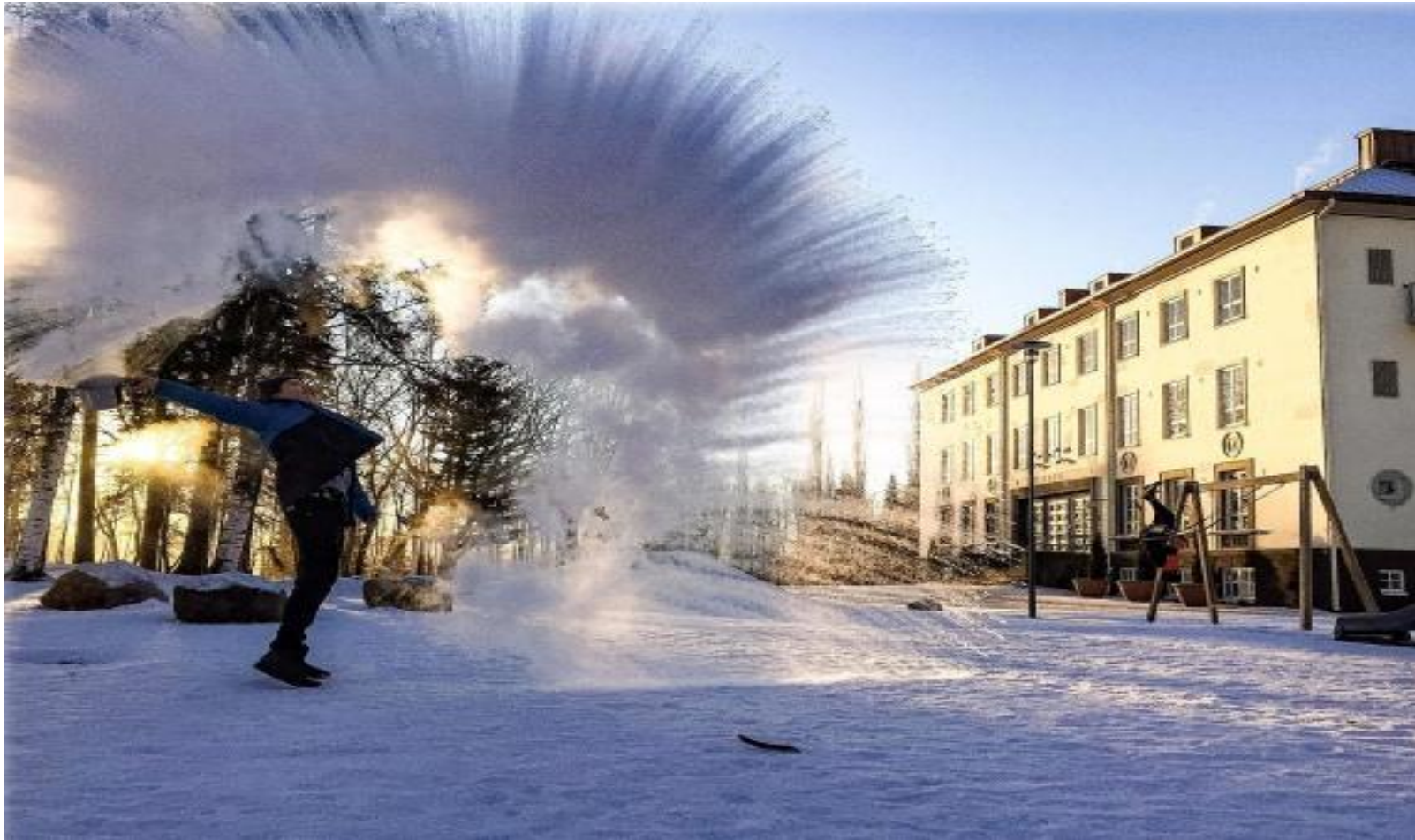
Figure 1. Artistic documentation of a spectacular experiment by the Mankola School, Jyväskylä: water freezing in midair at -20°C.