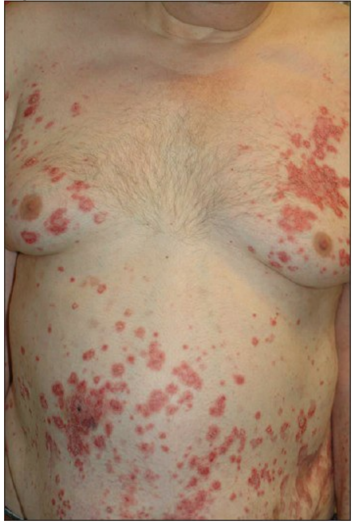
Figure 1: Multiple psoriasiform lesions mainly of the guttate type on the trunk that show Koebner's phenomenon