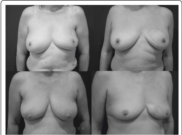
Figure 2 Long-term aesthetic results of OVR used in the four quadrants of the breast.