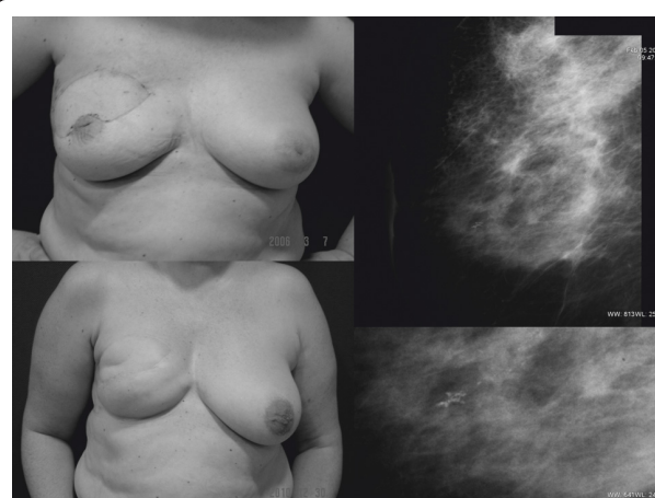
Figure 1 Appearance of the patient who suffered from an ipsilateral breast cancer recurrence, she underwent a skin-sparing mastectomy and immediate breast reconstruction with an adjustable breast implant. She did not want undergo a reduction mammoplasty for simmetrization. Mammography showed a small group of microcalcifications; the core biopsy confirmed an in situ ductal carcinoma.

We were able to interview and evaluate 23 patients cosmetically, the reasons for this being: three patients died, one had an ipsilateral recurrence and was mastectomized, three had a distant recurrence and were in a bad state, one was diagnosed and treated for contralateral breast cancer and one had a surgical procedure on the affected breast, while the rest refused to participate