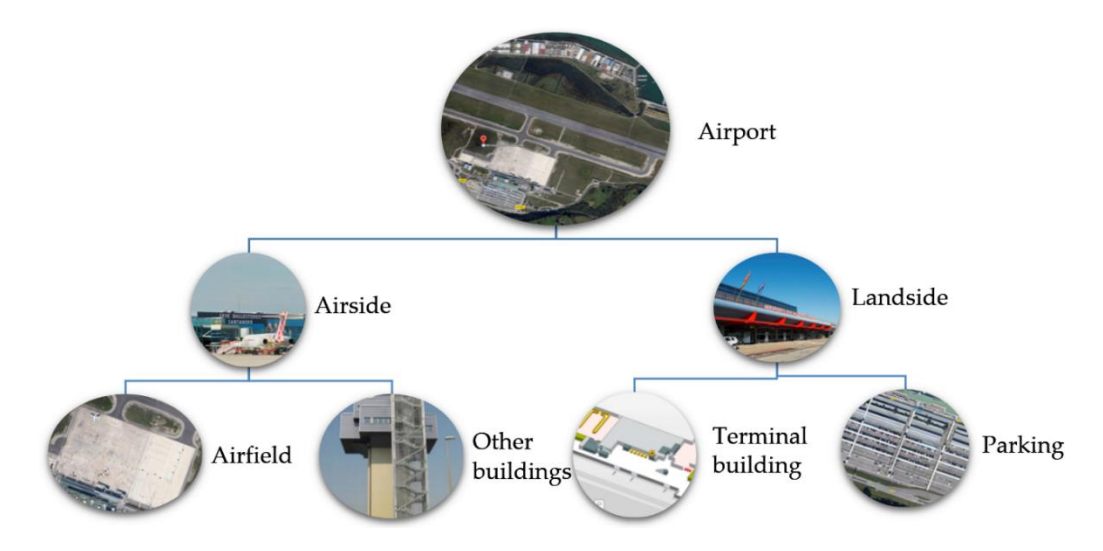
Figure 1. Scheme of main airport areas (Source: Airport Seve Ballesteros-Santander).